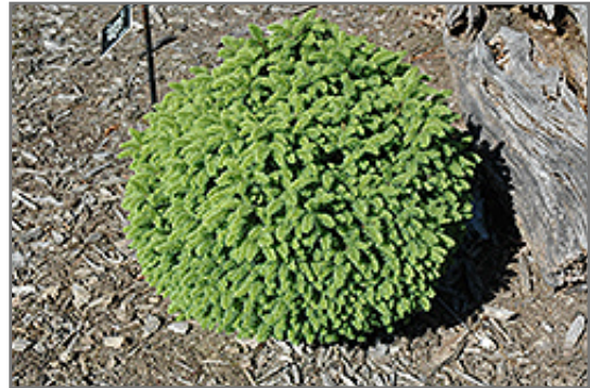
Humphrey's Gem Norway Spruce