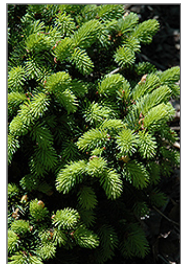
Calvary Upright Norway Spruce foliage