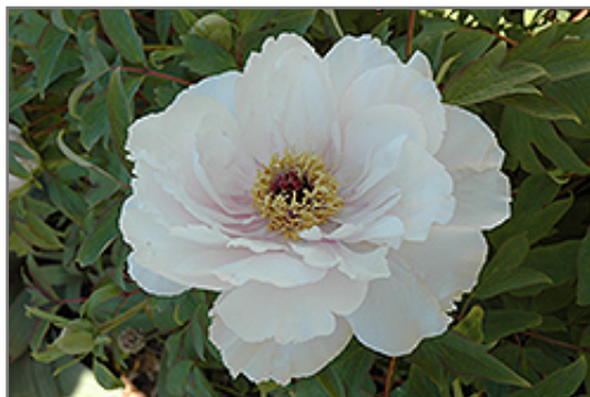
Fuji No Mine Tree Peony flowers

A very classy tree peony for the garden, with stunning white flowers with crimson eyes and prominent yellow stamens; great as an accent in the garden or massed in borders; unlike perennial peonies, remember to avoid pruning this variety