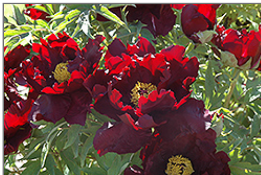
Boreas Tree Peony flowers

A beautiful woody peony, with bold flowers in a rich dark red with prominent yellow stamens, great as an accent in the garden or massed along borders; unlike perennial peonies, remember not to prune this variety