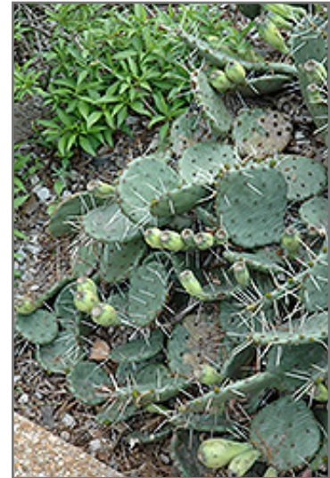
Plains Prickly Pear Cactus

This plant will require occasional maintenance and upkeep, and should never be pruned except to remove any dieback, as it tends not to take pruning well. Stray segments or shoots can be carefully removed or thinned to control the overall form and spread of the plant. Deer don't particularly care for this plant and will usually leave it alone in favor of tastier treats. Gardeners should be aware of the following characteristic(s) that may warrant special consideration;