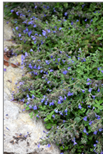
Kit Kat Catmint in bloom

Kit Kat Catmint is recommended for the following landscape applications;