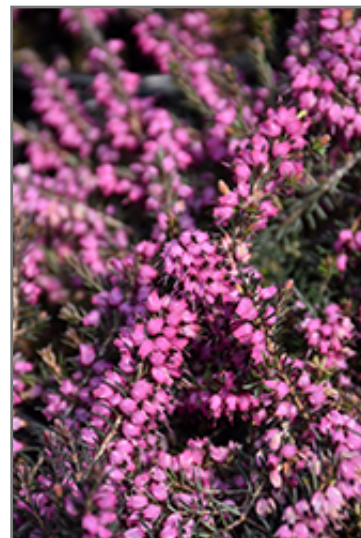
Springwood Pink Heath flowers