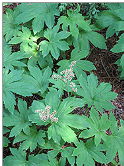
Crimson Fans Mukdenia flowers

This plant is not reliably hardy in our region, and certain restrictions may apply; contact the store for more information.