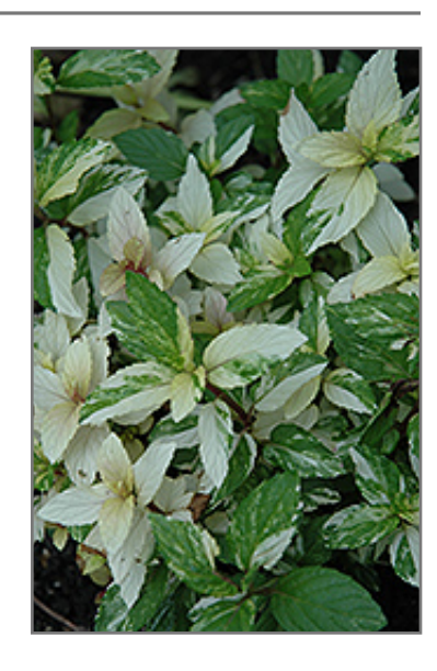
Variegated Peppermint foliage

Aside from its primary use as an edible, Variegated Peppermint is sutiable for the following landscape applications;