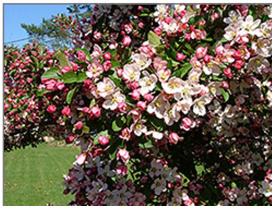
Guinevere Flowering Crab flowers