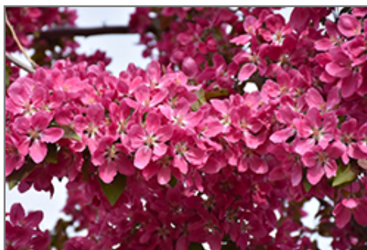
Big River Flowering Crab flowers