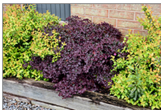
Purple Pixie Fringeflower