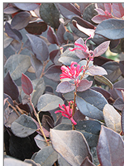
Purple Pixie Fringeflower flowers