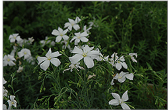
Diamond Perennial Flax flowers