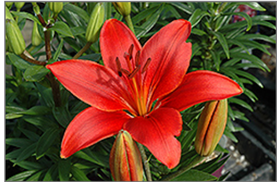
Crimson Pixie Lily flowers