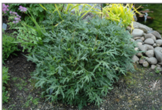
Dragon's Breath Rayflower