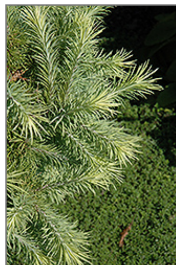
Wolterdingen Japanese Larch foliage