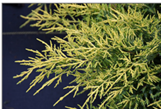
Saybrook Gold Juniper foliage