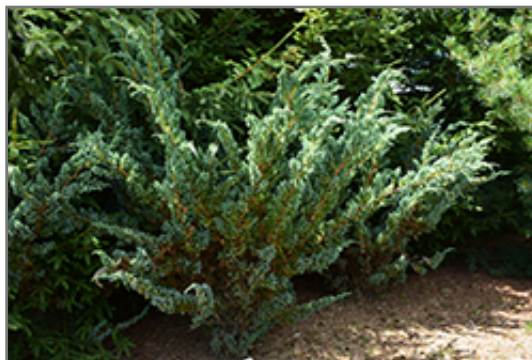
Meyer Juniper