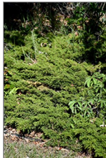
Sierra Spreader Juniper