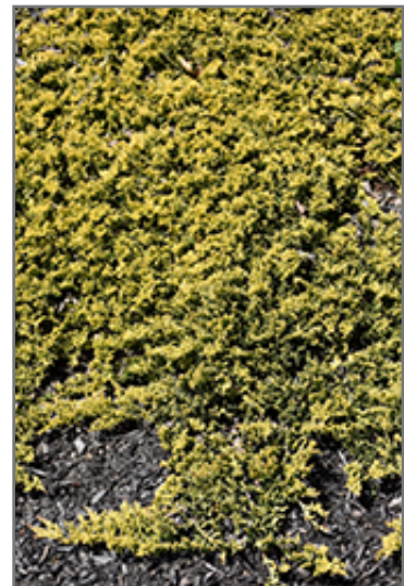
Mother Lode Juniper foliage