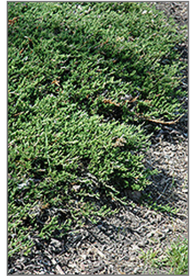
Jade Spreader Juniper

Jade Spreader Juniper will grow to be only 6 inches tall at maturity, with a spread of 6 feet. It tends to fill out right to the ground and therefore doesn't necessarily require facer plants in front. It grows at a slow rate, and under ideal conditions can be expected to live for approximately 30 years.