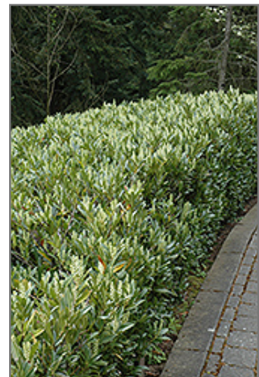
Otto Luyken Dwarf Cherry Laurel in bloom