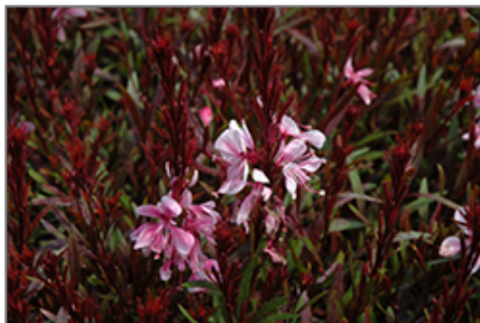
Passionate Blush Gaura flowers