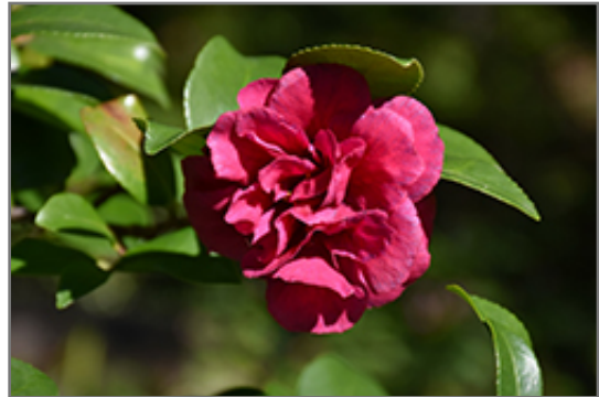
Bonanza Camellia flowers