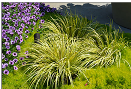
Grassy-Leaved Sweet Flag

Grassy-Leaved Sweet Flag is recommended for the following landscape applications;