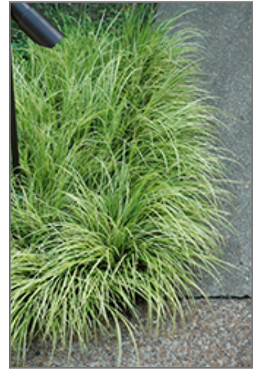
Grassy-Leaved Sweet Flag

Grassy-Leaved Sweet Flag will grow to be about 12 inches tall at maturity, with a spread of 12 inches. Its foliage tends to remain dense right to the ground, not requiring facer plants in front. It grows at a medium rate, and under ideal conditions can be expected to live for approximately 10 years. As an herbaceous perennial, this plant will usually die back to the crown each winter, and will regrow from the base each spring. Be careful not to disturb the crown in late winter when it may not be readily seen!