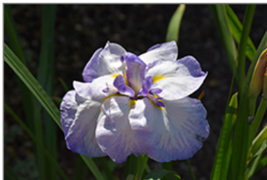
Butterflies In Flight Japanese Iris flowers

Other Names: Japanese Water Iris, Russian Iris, Japanese Flag