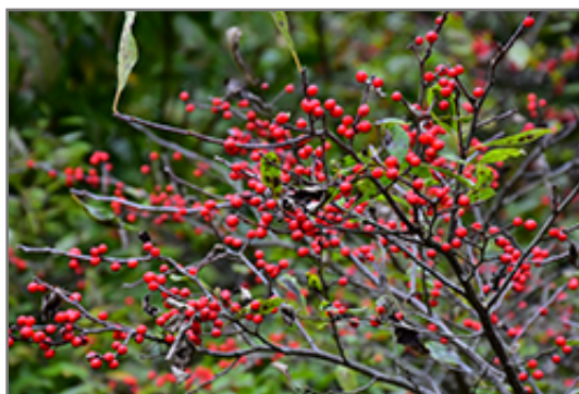
Autumn Glow Winterberry Holly fruit