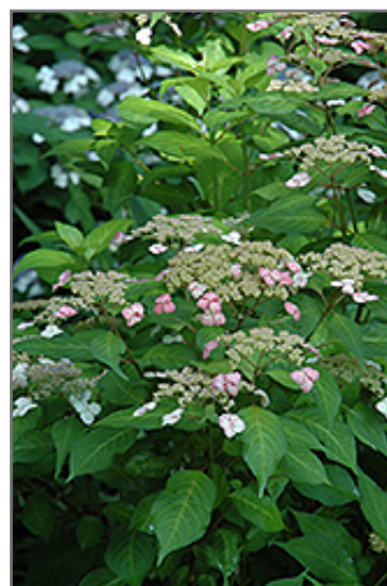
Golden Sunlight Hydrangea flowers