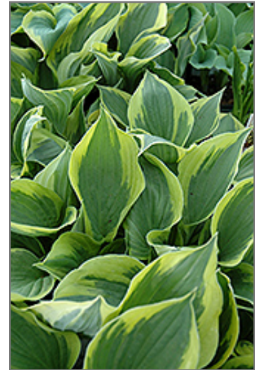
Twilight Hosta foliage

Twilight Hosta is recommended for the following landscape applications;