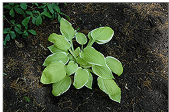
St. Elmo's Fire Hosta