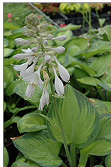
Paradigm Hosta flowers

Paradigm Hosta is recommended for the following landscape applications;