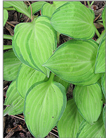
Emerald Tiara Hosta foliage

Emerald Tiara Hosta is recommended for the following landscape applications;