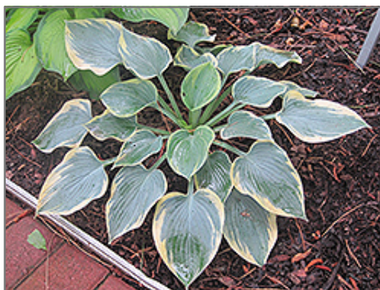
Aristocrat Hosta