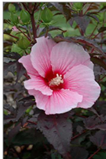
Summer Storm Hibiscus flowers