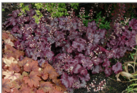
Plum Royale Coral Bells in bloom