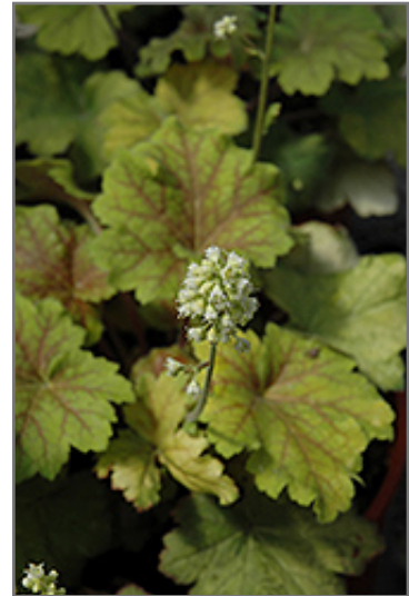
Electra Coral Bells flowers