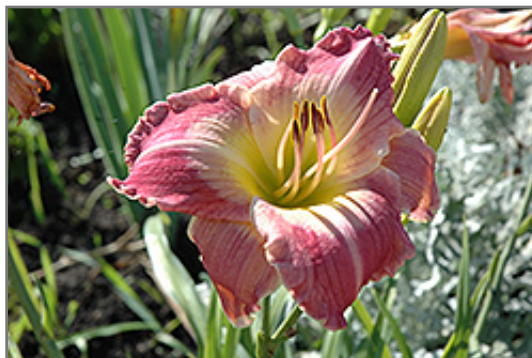
Tuxedo Moon Daylily flowers