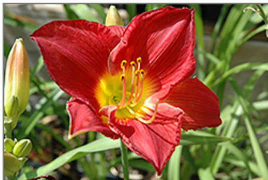
Scarlet Orbit Daylily flowers