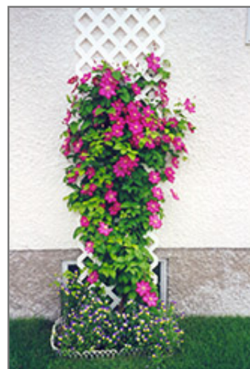
Ville de Lyon Clematis in bloom