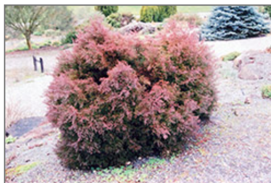
Ericoides Whitecedar in winter