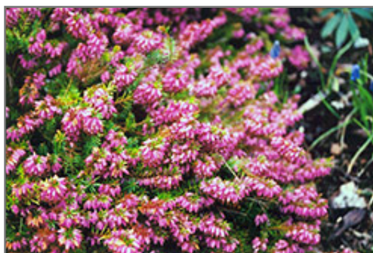
Gold Haze Heather flowers