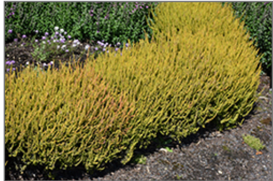
Firefly Heather

This plant is not reliably hardy in our region, and certain restrictions may apply; contact the store for more information.