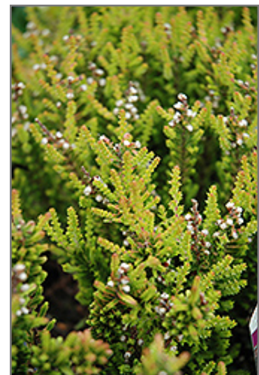
Firefly Heather foliage