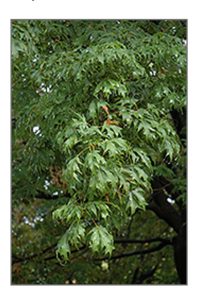
Sweet Shadow Sugar Maple foliage