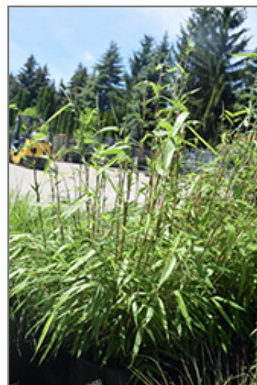
Rufa Clump Bamboo