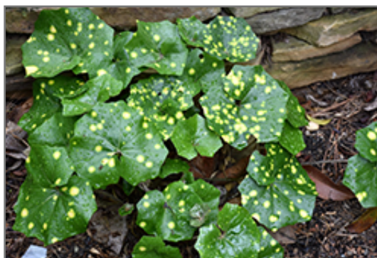
Variegated Leopard Plant