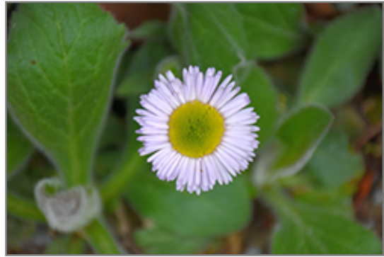
Lynnhaven Carpet Fleabane flowers

Lynnhaven Carpet Fleabane will grow to be about 7 inches tall at maturity extending to 15 inches tall with the flowers, with a spread of 15 inches. Its foliage tends to remain low and dense right to the ground. The flower stalks can be weak and so it may require staking in exposed sites or excessively rich soils. It grows at a fast rate, and under ideal conditions can be expected to live for approximately 10 years. As an herbaceous perennial, this plant will usually die back to the crown each winter, and will regrow from the base each spring. Be careful not to disturb the crown in late winter when it may not be readily seen!