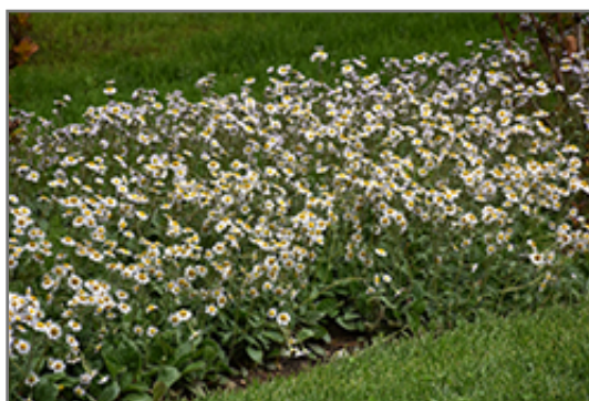
Lynnhaven Carpet Fleabane in bloom