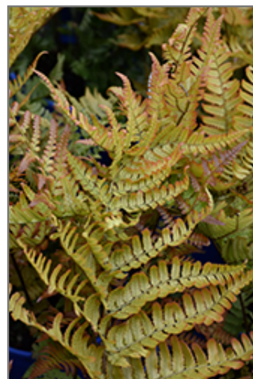
Brilliance Autumn Fern foliage