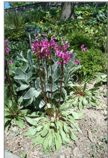
Aphrodite Shooting Star in bloom