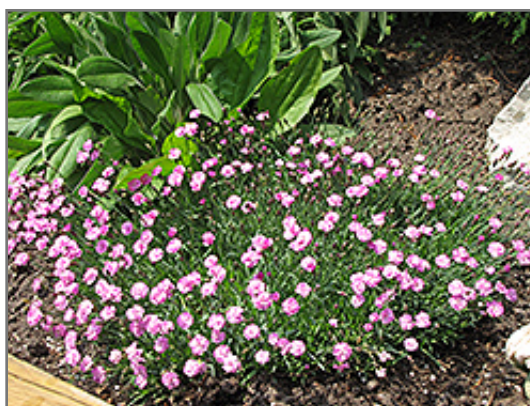
Tiny Rubies Dwarf Mat Pinks in bloom