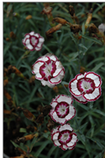
Raspberry Swirl Pinks flowers

Raspberry Swirl Pinks is recommended for the following landscape applications;